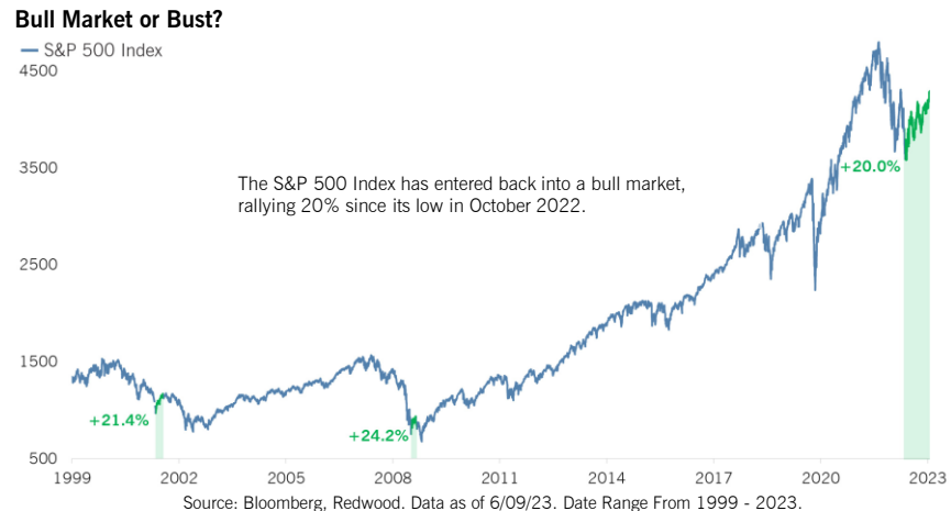
Chart of the Week