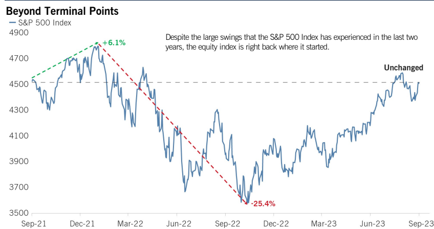
Chart of the Week