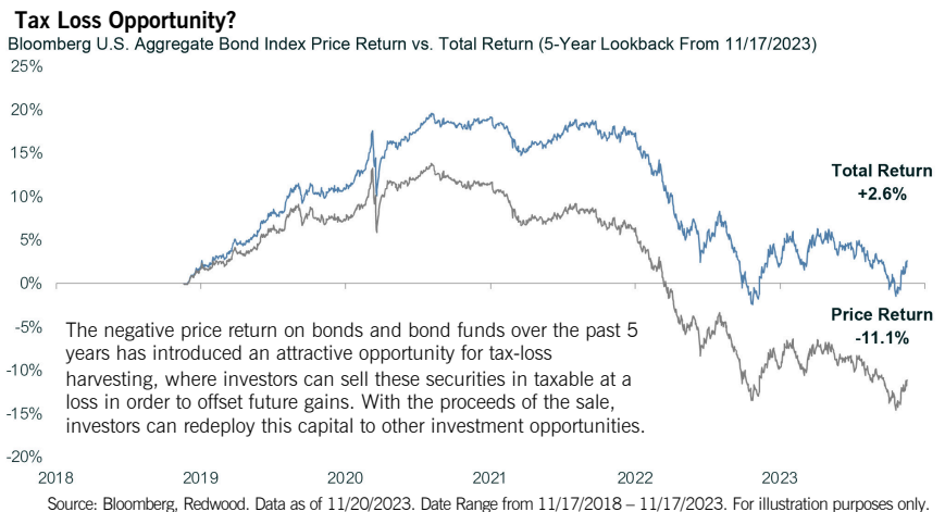
Chart of the Week