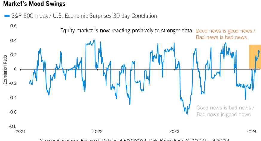
Chart of the Week