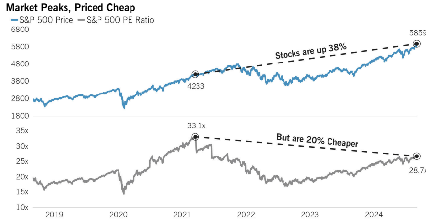
Source: Bloomberg, Redwood. Data as of 10/24/2024. Date Range from 10/19/2018 – 10/24/2024.